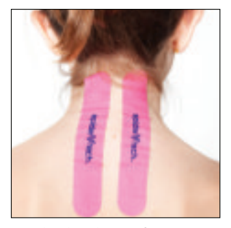
Central Neck Application of I-PowerStrip