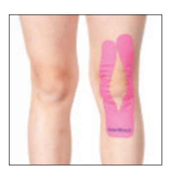
Central Knee Application of Y-PowerStrip