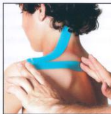
Lateral Neck/Shoulder (Upper Trapezius strain) Application of Y-PowerStrip