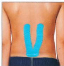
Low Back Application of Y-PowerStrip