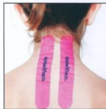
Central Neck Application of I-PowerStrip