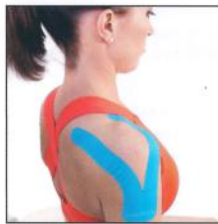
Shoulder (Rotator Cuff, Shoulder Mechanics) Application of Y-PowerStrip