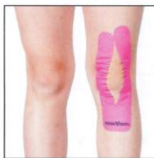
Central Knee Application of Y-PowerStrip