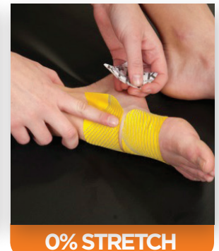
APPLY: Lay ends down without stretch.

ANCHOR: Apply the middle of a second half strip higher on the foot with 80% stretch in the middle of tape.