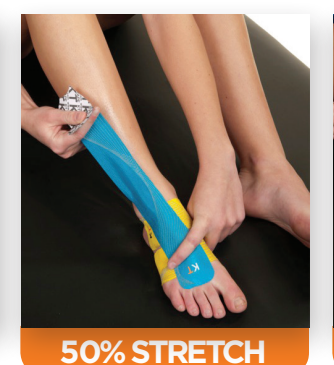
APPLY: Apply the tape up the foot to the shin with 50% stretch.