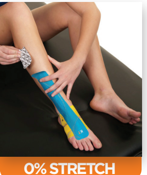
FINISH: Apply the last 2 inches without stretch.

CAUTION: If you have skin sensitivities, cancer, or are pregnant, consult your doctor before use. Discontinue use if skin becomes irritated or sore. KT TAPE* is not a replacement for professional medical care. Warranties and remedies limited to product replacement cost. READ ALL CAUTIONS ON ENCLOSED INSTRUCTION SHEET PRIOR TO USE.