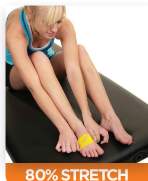
ANCHOR: Apply middle of a half strip of tape over the point of pain with 80% stretch. STRIP TWO