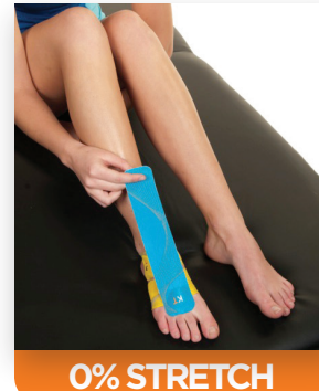
ANCHOR: Anchor a full strip behind the toes.