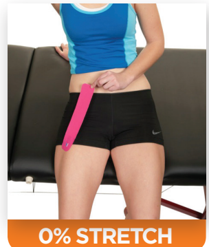
ANCHOR: a full strip

without stretch 3 inches below the point of pain*