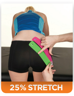
APPLY: Apply the tape over the line of pain with 25% stretch.