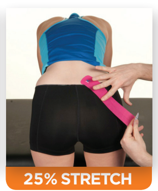
APPLY: Apply the tape over the line of pain with 25% stretch.