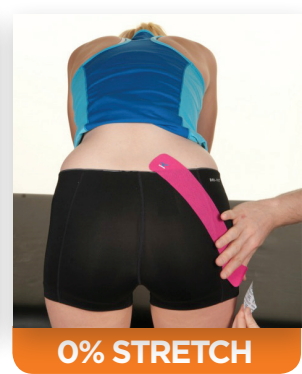
FINISH: Lay the last two inches of tape down without stretch.