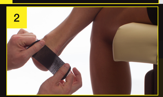
Anchor middle portion of half-strip with 90% stretch over most intense point of pain.