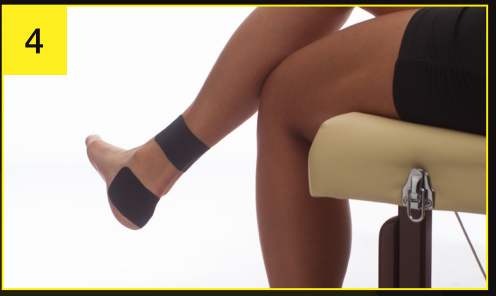
Repeat with second half-strip above or below first strip depending on location of pain.