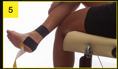
Anchor full-strip on bottom of foot just in front of heel.