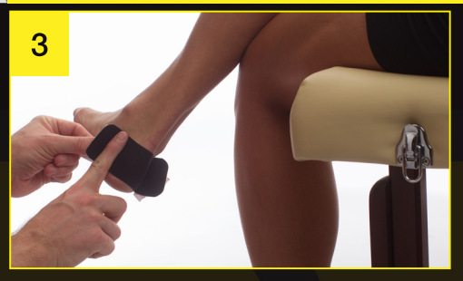
Lay each end down with no stretch.